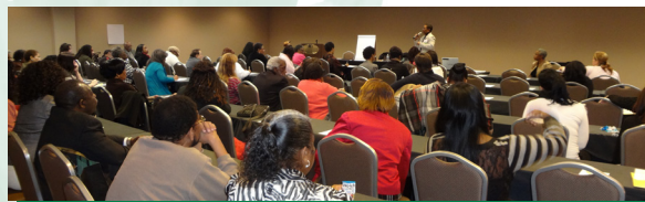
Community Mental Health Conference